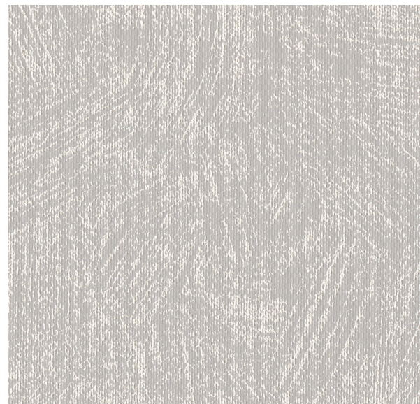
Romany Light Grey